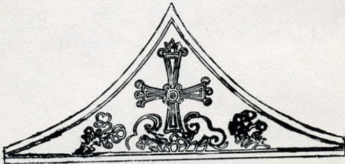
Cross surmounting the Church of the East Monument in China erected eighth century A.D. to commemorate the fifth centenary of that mission.